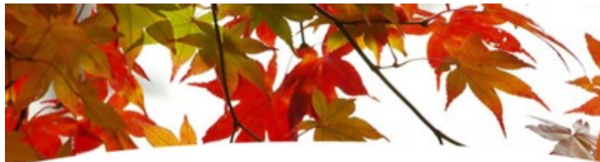
Autumnal salutations from Norwescon!