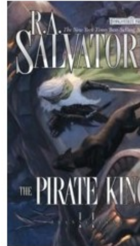
The Pirate King (Wizards of the Coast) Released 10/07/2008